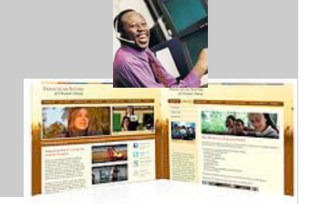
MINDFUL OF THE USER Created for the business person and user community emphasizing a 'Delightful Experience'