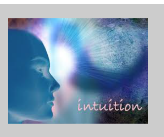
AWARENESS Gaining intuition and a feel of the market